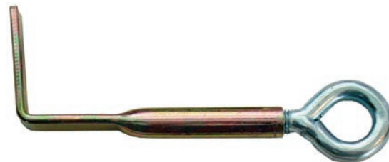
Expandet Bedding Anchor with internal thread and Scaffold Screw with metric thread can be used together in brickwork